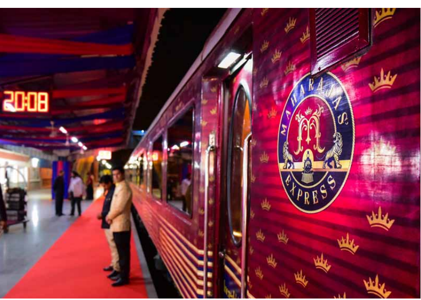
Clockwise from top left: The Maharaja's Express is regularly awarded best train journey in the world; an unforgettable reception in Jaipur; a spacious double stateroom