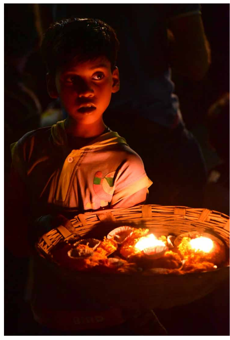
Left to right: Muscians in City Palace; a child sells blessing blossums on the Ganges

dance in the morning breeze. Spice and coffee scent the air as we climb to the fort's entrance, where the stone path is worn to a polish. The Amber Fort, also known as the Amber Palace, was once home to the Rajput Maharajas and now receives more than 5,000 visitors a day. We join the crowds, emerging into a vast courtyard, one of four, ringed by exquisite Mogul and Rajput architecture in pale yellow. Ancient fortifications cling to the surrounding mountain slopes like scales as they lead up to the Jaigarh Fort, built atop Cheel ka Teela, the Hill of Eagles, to protect the royal residence below. From the ramparts above the Amber Palace's Diwan-e-Khas, the Hall of Private Audience, children peak through