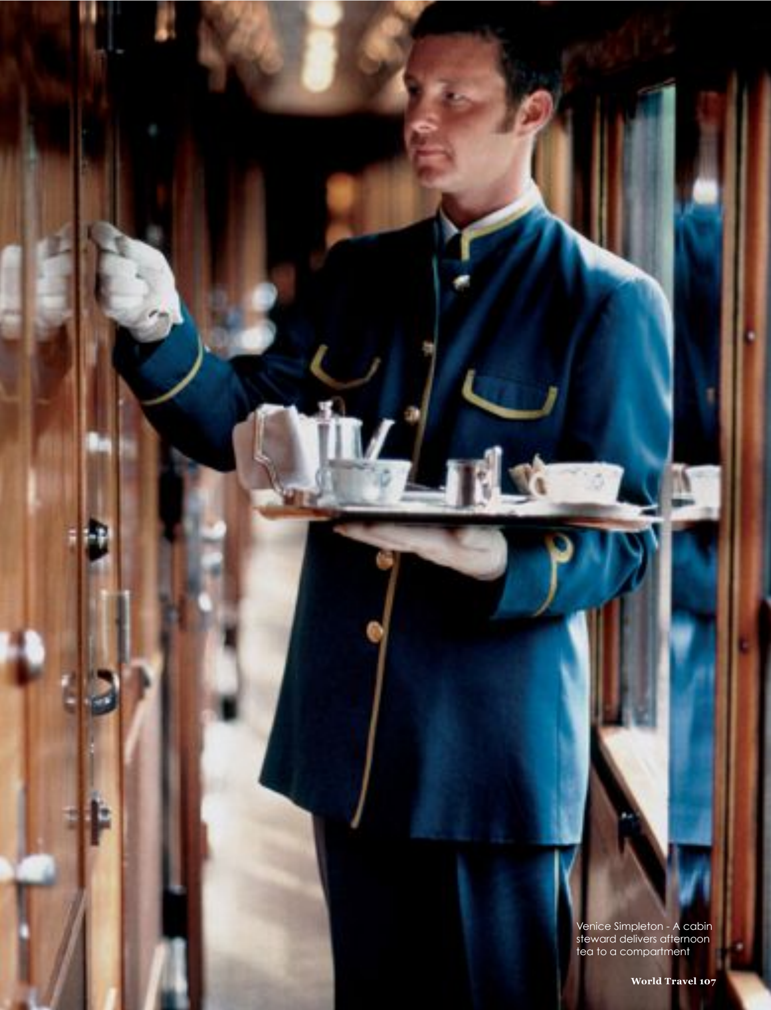
Venice Simpleton - A cabin steward delivers afternoon tea to a compartment